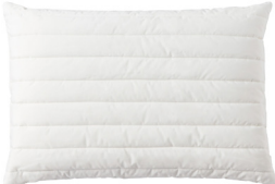
Pillows (U.P. $19.00 - $69.00)