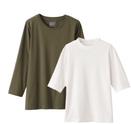
Ladies' Selected T-Shirts (U.P. $15.90 - $39.00)

MUJI uses hand-harvested organic cotton. The fibre of the cotton has less damage than machine-harvested and has a softer texture.