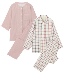
Pajamas (U.P. $59.00 - $69.00)