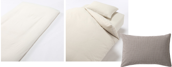
Organic Washed Cotton Bedlinen (U.P. $13.00 - $99.00)