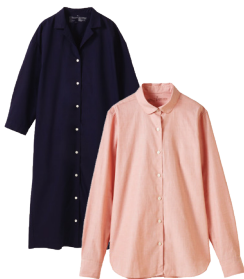
Ladies' Selected Shirts & Dresses (U.P. $29.00 - $69.00)