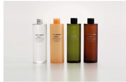
All Skincare Series (U.P. $1.60 - $43.00)