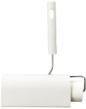
Cleaning System (U.P. $3.30 - $59.00)