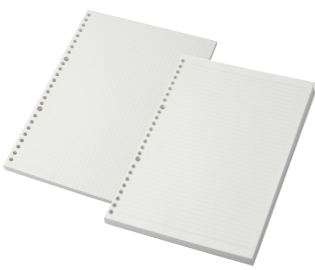
Loose-leaf (U.P. $1.90 - $3.60)