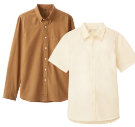
Men's Oxford/ Broad Shirts (U.P. $29.00 - $49.00)