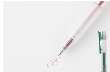
Gel Ink Pens & Refill (U.P. $1.10 - $23.00)