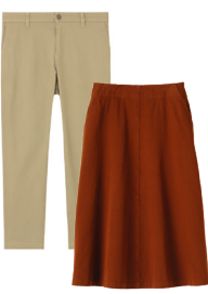
Ladies' Selected Skirts & Chino Pants (U.P. $15.90 - $69.00)