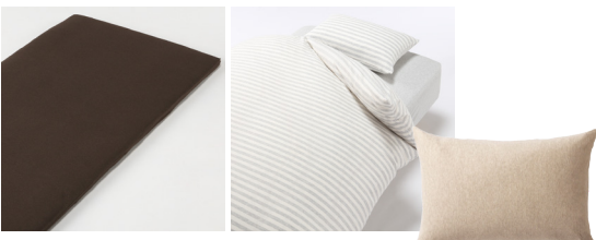
Organic Jersey Bedlinen (U.P. $13.00 - $99.00)