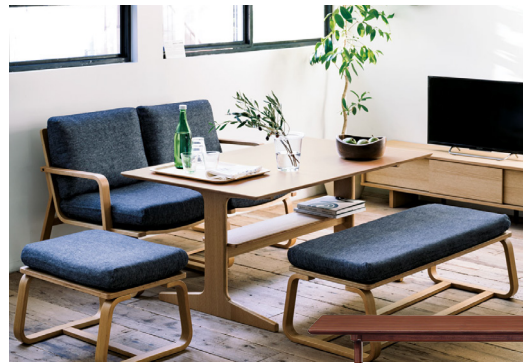
Living Dining Series (U.P. $49.00 - $949.00)