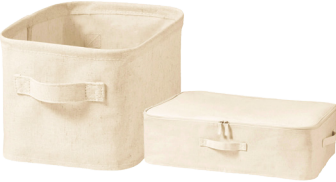
Cotton Linen Box (U.P. $9.90 - $36.00)