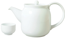
White Porcelain (U.P. $3.90 - $25.90)