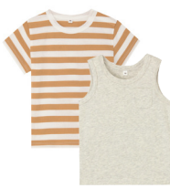
Kids' T-Shirts, Tank Tops & Tunics (U.P. $10.90 - $19.90) *Available in selected stores only