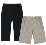
Kids' Leggings & Pants (U.P. $11.90 - $12.90) *Available in selected stores only