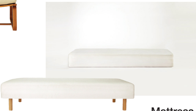
Mattress (U.P. $239.00 - $1799.00)

All promotions end on 12 September 2018 or while stocks last.