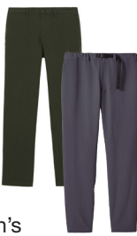
Men's Trousers (U.P. $59.00 - $69.00)