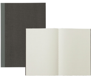
Notebooks (U.P. $0.90 - $8.90)