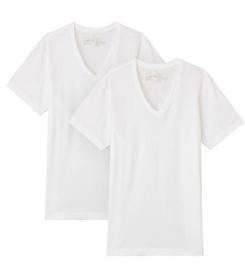
Men's & Ladies' 2 Pcs Pack (U.P. $15.90 - $24.90)