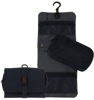
Hanging Box Case (U.P. $23.00 - $26.00)