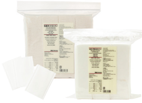
Cotton Puffs (U.P. $4.60 - $8.90)