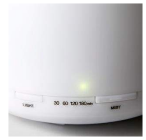
It has a timer that can be set up to four stages of 180/120/60/30 minutes.