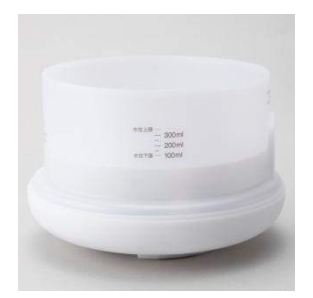
The larger capacity tank can hold up to 350ml of water.