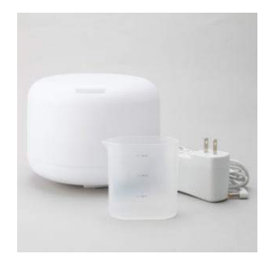
<u>A set contains:</u> ultrasonic aroma diffuser, measuring cup, AC power adapter.