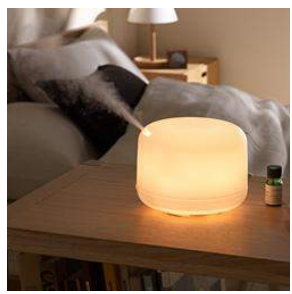
In the amount of mist of 90-100ml, I can spread the moisture and flavor to the space about 3 times of regular sized Aroma Diffuser, in 1 hour.