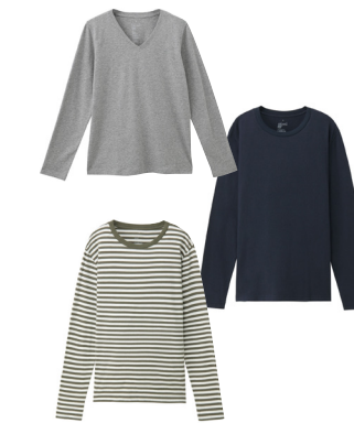
Ladies' & Men's Organic Cotton Long Sleeve T-Shirt (U.P. $15.90 - $19.90)