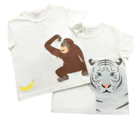
Singapore Special Kids Print T-shirt (U.P. $15.90 - $19.90)

Be the first to discover our line-up of limited merchandise that will be sold exclusively at Plaza Singapura outlet!