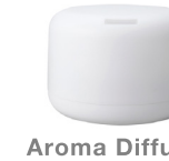
Aroma Diffuser - Large** (U.P. - $139.00)