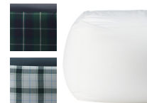
Beads Sofa with Cotton Twill Cover* (U.P. $248.00)