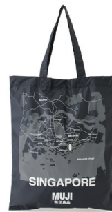
Limited Edition Foldable Paraglider Bag with Singapore Map $23.00