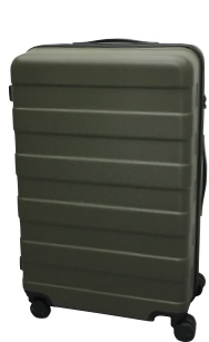
Hard Carry Case Smoky Green (U.P. $199.00 - $399.00)