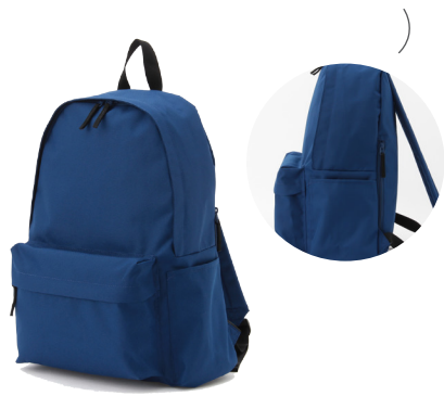
Rucksack with Side Zip (U.P. RM149)