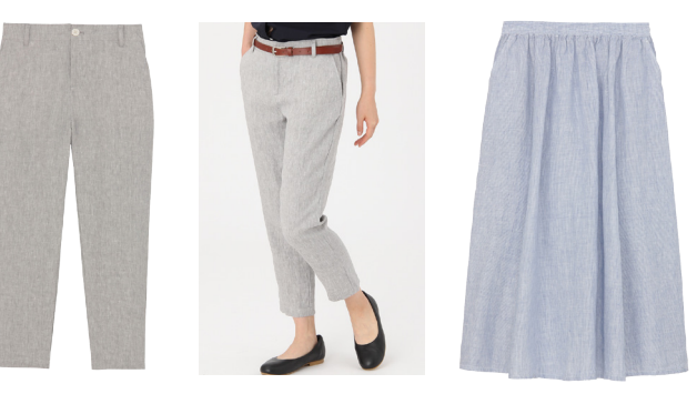
Ladies' French Linen Skirts / Pants (U.P. RM149 - RM179)