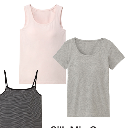
Silk Mix Cup (U.P. RM79 - RM149)