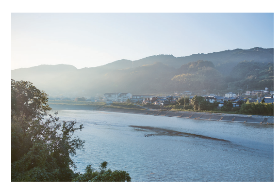
The river Kii which flows at the foot of the mountain. It is being used to transport the woods since long time ago.

Standing in the Japanese Cypress forest, a cool breeze brings out the fragrance of wood that makes one feel refreshed and calm. The northern part of Wakayama, at the foot of Koyasan. Located in the center of Kii Peninsula, a place where nature and human coexists, and a rich ecosystem with many trees preserved. One of the reason is through the hands of human. In this region, Japanese cedar and cypress have been planted for more than 100 years ago. With adequate sunlight and breeze between trees, thick and straight trees which can be used as building materials are cultivated through dense planting and periodic thinning. Using the timber from the forest thinning or curved wood which cannot be sold to the market, "Essential oil - Hinoki" is made.