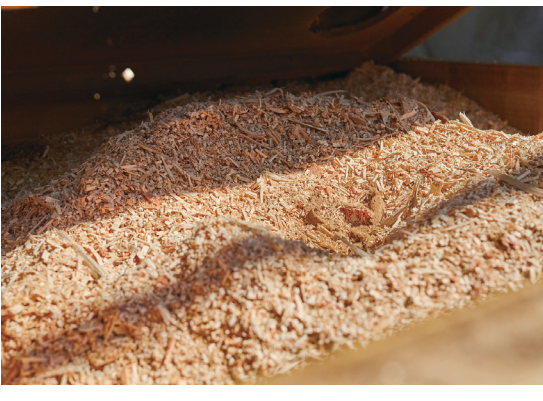
The lumber is crushed to chips just before distillation. The moist chips give out the fragrance of Hinoki.

The moisture content of freshly cut Hinoki is about 50%. To prevent the loss of scent components, the processed Hinoki in the lumber mill are transported within a week to the distillery. In the distiller, the scent components are extracted by steaming through the chips. After distillation, the Hinoki chips are being dried and reused as fuel to produce heat in the boiler which generates the steam. About 3.5 litres of essential oil are extracted from one distillation of 350 kg of Hinoki. The fragrance of woods is densely condensed to only 1%.