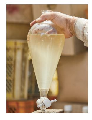
The distilled liquid separates into essential oil and herb water after being left for some time. Let the herb water flow down from the bottom, leaving only the essential oil