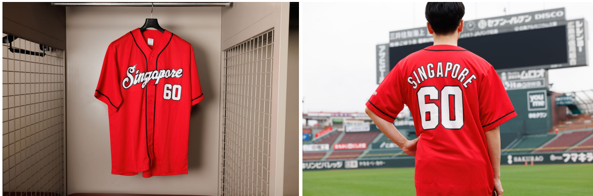
Image: SG commemorative uniform