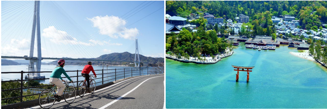
Left to right: Scenic ride along the Tatara Bridge, O-Torii gate of Itsukushima Shrine on Miyajima Island

MUJI invites you to experience the beauty of Hiroshima in a whole new way on two wheels. This exclusive cycling tour blends scenic rides, cultural discoveries, and unforgettable local flavours, offering a unique journey through Hiroshima's picturesque landscapes and historic sites.