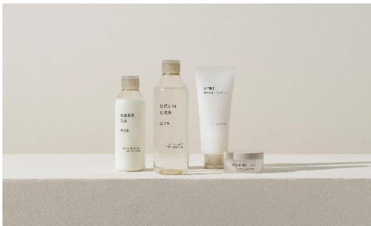
Left to right: Moisturising Milk, Toning Water, All-in-One Gel, Moisturising Cream

The Sensitive Skin Series offers gentle, deeply moisturising care for all ages and skin types, including those with sensitive or easily irritated skin as well as first-time skincare users. Thoughtfully formulated with 100% natural ingredients 2 , this low-irritation series is free from synthetic fragrances, colourants, parabens, alcohol, and phenoxyethanol.