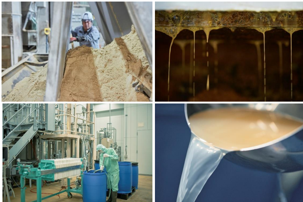
Manufacturing process of the Booster Series

As interest in fermented and rice-derived skincare continues to rise globally for its gentle efficacy and natural origin, MUJI offers its own proprietary formulation rooted in simplicity and quality. At the heart of the Booster Series is MUJI's proprietary Fermented Rice Bran Extract, crafted from rice bran produced in Yamagata which is cultivated with mountain water that is rich in seven types of vitamins and eight types of minerals. The nutrient-dense layer, traditionally removed during rice polishing, is carefully transformed through a gentle fermentation process into a moisturising liquid that help refine skin texture and boost hydration.