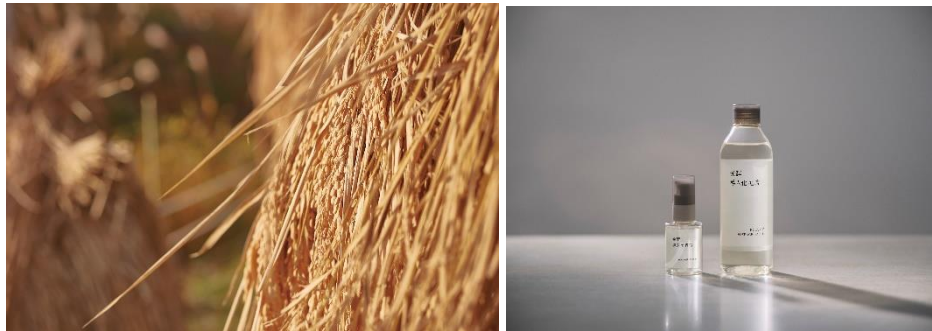
Left to right: Rice bran used in the skincare products, Booster Serum and Booster Essence Lotion

As interest in fermented and rice-derived skincare continues to rise globally for its gentle efficacy and natural origin, MUJI offers its own proprietary formulation rooted in simplicity and quality. At the heart of the Booster Series is MUJI's proprietary Fermented Rice Bran Extract, crafted from rice bran produced in Yamagata which is cultivated with mountain water that is rich in seven types of vitamins and eight types of minerals. The nutrient-dense layer, traditionally removed during rice polishing, is carefully transformed through a gentle fermentation process into a moisturising liquid that help refine skin texture and boost hydration.