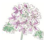
Verbena (Verbena Officinalis Extract)