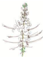
Cat Whiskers (Orthosiphon Stamineus Extract)

The blending of plant extract from Okinawa together with moisture-rich royal jelly acid will result in healthy and smooth skin. Fragrance of the essential oil could have a relaxing effect and take good care of the skin. There are three types of natural plant extract namely Cats Whiskers (Orthosiphon Stamineus Extract), Verbena (Verbena Officinalis Extract), and Tropical Turmeric (Turmeric Extract). Plant ingredients such as Verbena has a moisturizing effect that keeps skin good hydro-balanced.