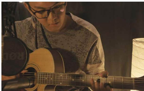
Hanging Up The Moon (Left), Bennett Bay (Right)