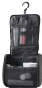
Hanging Bath Case