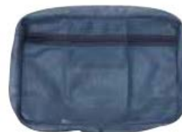
Washable Clothes Case

Make from the same material as laundry nets. Simply place it in the washing machine for cleaning when you return from your trip!